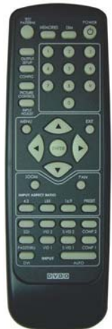
Infrared Remote Control with discreet codes