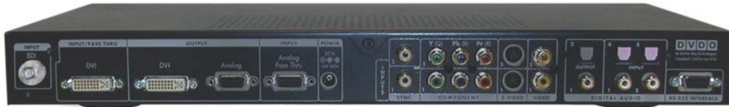
Rear panel of the iScan™ HD / HD+