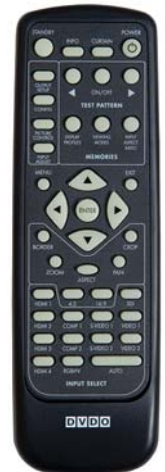
Infrared Remote Control with Discrete codes